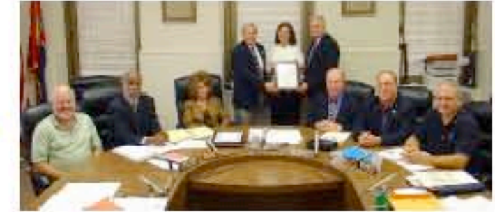
County Supervisors Declare Official Home of Grace Day

Committed to an excellent standard of stewardship and accountability, this non profit program is governed by a Board of Directors comprised of highly respected Christian business men and women. The Home of Grace has been endorsed by both local and national leaders.